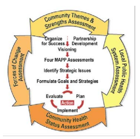
Figure 3: Mobilization for Action through Planning and Partnerships

Partnerships (MAPP), a nationally-recognized model for conducting community health assessments and strategic planning for community health improvement, supported by the Centers for Disease Control and Prevention (CDC) and the National Association of County and City Health Officials (NACCHO). The tool helps communities improve health and quality of life through community-wide and community-driven strategic planning. The MAPP assessments can be tailored to suit the needs of most communities. MAPP is the foundation of the planning process, and includes the identification of strategic issues and goal/strategy formulation as prerequisites for action. Through MAPP, communities can seek to achieve optimal health by identifying and using their resources wisely, taking into account their unique circumstances and needs and forming effective partnerships for strategic action.